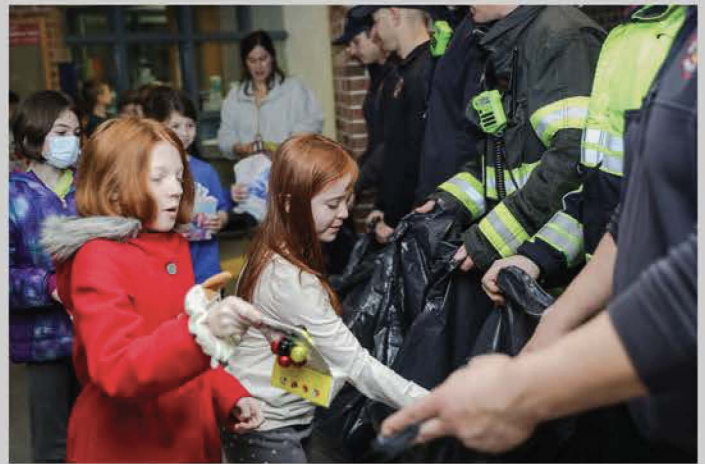
PICTURED: Lions Park students place their toy drive gifts in bags.