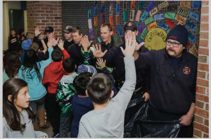
PICTURED: Lions Park students give high-fives to Mount Prospect fire fighters for their collaborative toy drive efforts.