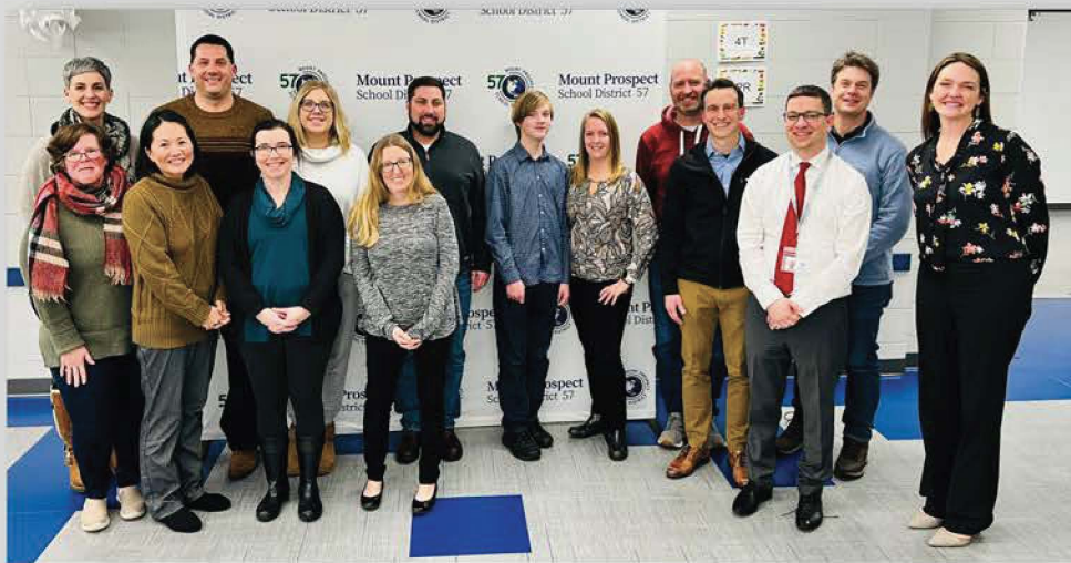
PICTURED: Members of CFAC pose with D57 Board Members.