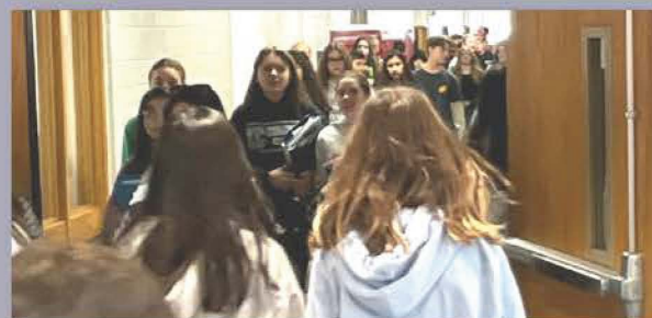
PICTURED: A Lincoln hallway during a passing period.

As part of the district's effort to quantify the costs associated with providing full-day kindergarten, an